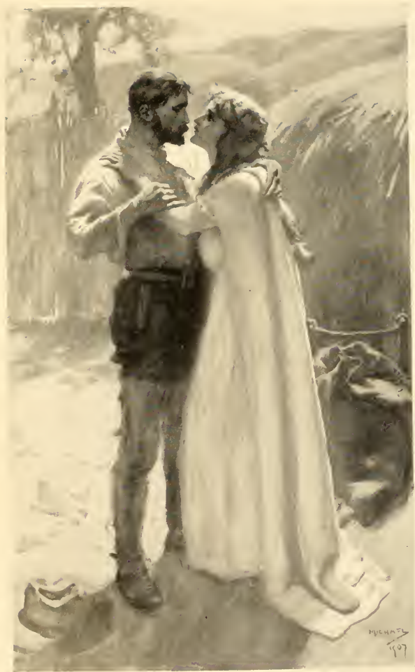
" He . . . kissed her on the lips " (see page 181).